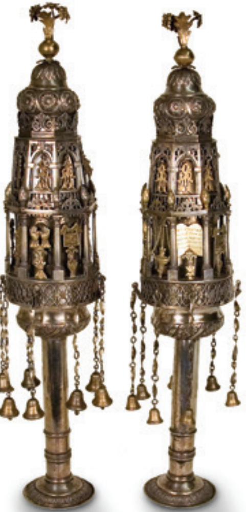
ABOVE: Torah Finials, 1883, Livorno, Italy; Silver and brass. Loan from Judah L. Magnes Museum, Purchase with funds from the Goor Fund. OPPOSITE PAGE RIGHT: The Great Synagogue of Rome (1904). The Great Synagogue of Rome was no mere copy of a Roman temple. This building displayed not just Roman but Greek, Assyro-Babylonian and even Egyptian elements—a proud projection of the variegated history—and identity—of the Jewish community.

In 1965, the Second Vatican Council reversed the Church’s position on the Jews, acknowledging their common patrimony and making discrimination towards Jews officially against Church doctrine. In 1979, Pope John Paul II visited Auschwitz. On April 13, 1986, paying unprecedented respect to the people whom Titus had led in chains 2,000 years before, Pope John Paul II visited the Great Synagogue of Rome, addressing the Jews as his “elder brothers”. DRW MB