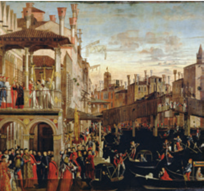
TOP: Shylock, from an engraving depicting Act 2 Scene 8; of William Shakespeare's play The Merchant of Venice ; Sir John Gilbert. The action Gilbert illustrates occurs after Shylock learns that his daughter Jessica has eloped with Lorenzo — and his money. Salarino and Solanio describe Shylock running madly through the streets crying, “My daughter! O my ducats! O my daughter, Fled with a Christian! O my Christian ducats!” BOTTOM THIS PAGE & OPPOSITE PAGE RIGHT: The Miracle of the Relic of the True Cross on the Rialto Bridge, 1496. Oil on Canvas; Vittore Carpaccio.

By far the most well known Venetian Jew, and notorious trader, is Shylock— a fictitious character invented by a playwright who most probably had never met a Jew. When Shakespeare wrote The Merchant of Venice at the tail end of the 16th century, it is doubtful there were any Jews in England, the community having been expelled in 1290.