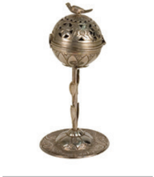
TOP: Ghetto Vecchio , Venice, late 1930s Photo: Ernő Munkácsi, Hungarian Jewish Museum and Archive Budapest. The photo shows the narrow core of the Ghetto Vecchio and, in the background, the Spanish Synagogue, still in active use today. BOTTOM: Spice Box , 19th century, Italy; Silver. Loan from Judah L. Magnes Museum Purchase.