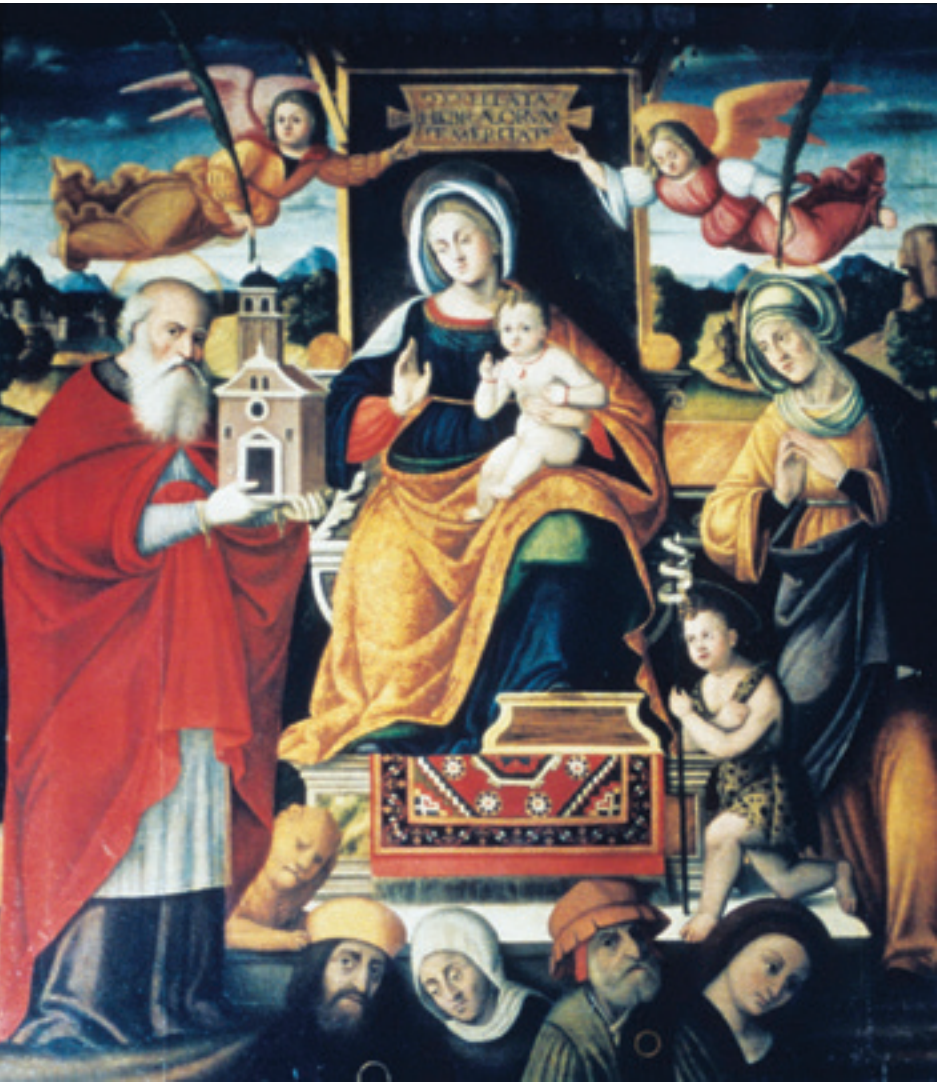
Madonna and Child with Saints and Norsa Family, c. 1499, Mantova. Originally in the Church of Santa Maria della Vittoria, now in the Basilica of Sant’Andrea.

If the Norsa Madonna expresses Christian superiority over the Jew, what Michelangelo frescoed on the ceiling of the Sistine Chapel in the early part of 16th century makes quite a different argument. Here, the figure of Aminadab, said to be an early ancestor of Jesus, clearly wears a Jewish yellow badge— perhaps a reminder from Michelangelo to the Pope, of Christianity’s Jewish roots. DRW