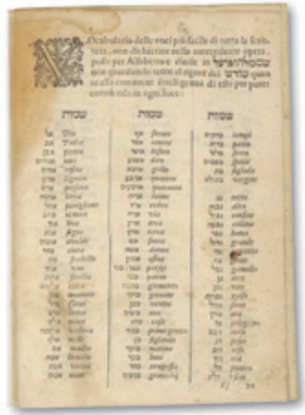
TOP: Bet Yehuda , Leone Modena, Venice, 1635; private collection. This is a first edition of a commentary on the Talmud by Leone Modena, perhaps the major Jewish thinker of his era. As with many of his other works, the tone of Bet Yehuda is hostile to kabbalistic interpretation. BOTTOM: Novo Dittionario Hebraico , Leone Modena, Venice, 1612. The Bancroft Library, University of California, Berkeley. This is a curious mixture of cultures. Modena wrote this Hebrew-Italian dictionary in Italian, but the word lists are organized by parashot , the weekly Torah readings.