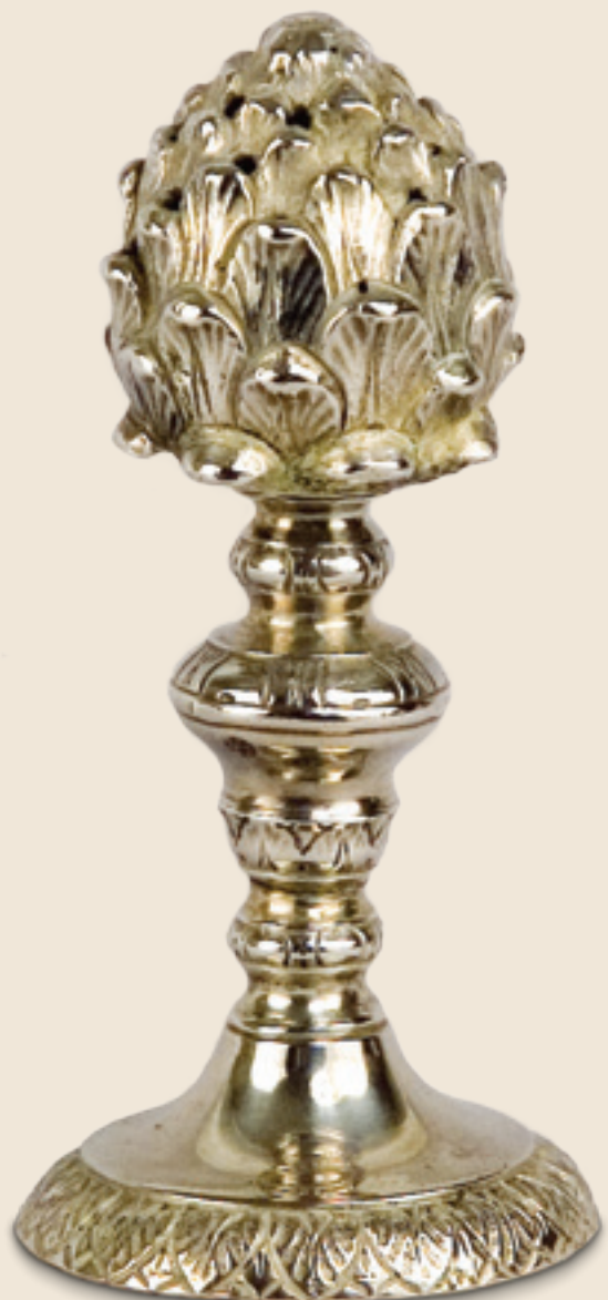
Spice Box , 18th century, Italy; Silver. Loan from Judah L. Magnes Museum Purchase

The task of demonstrating this view of Italian culture has presented varied challenges. The material evidence of a thriving Jewish culture is best demonstrated by artifacts themselves, and in this respect the Museo ItaloAmericano has carefully assembled a collection of items from the 16th through 19th centuries which form the tangible core of the exhibit. In particular, the Museo is endlessly grateful to the Judah L. Magnes Museum, just across