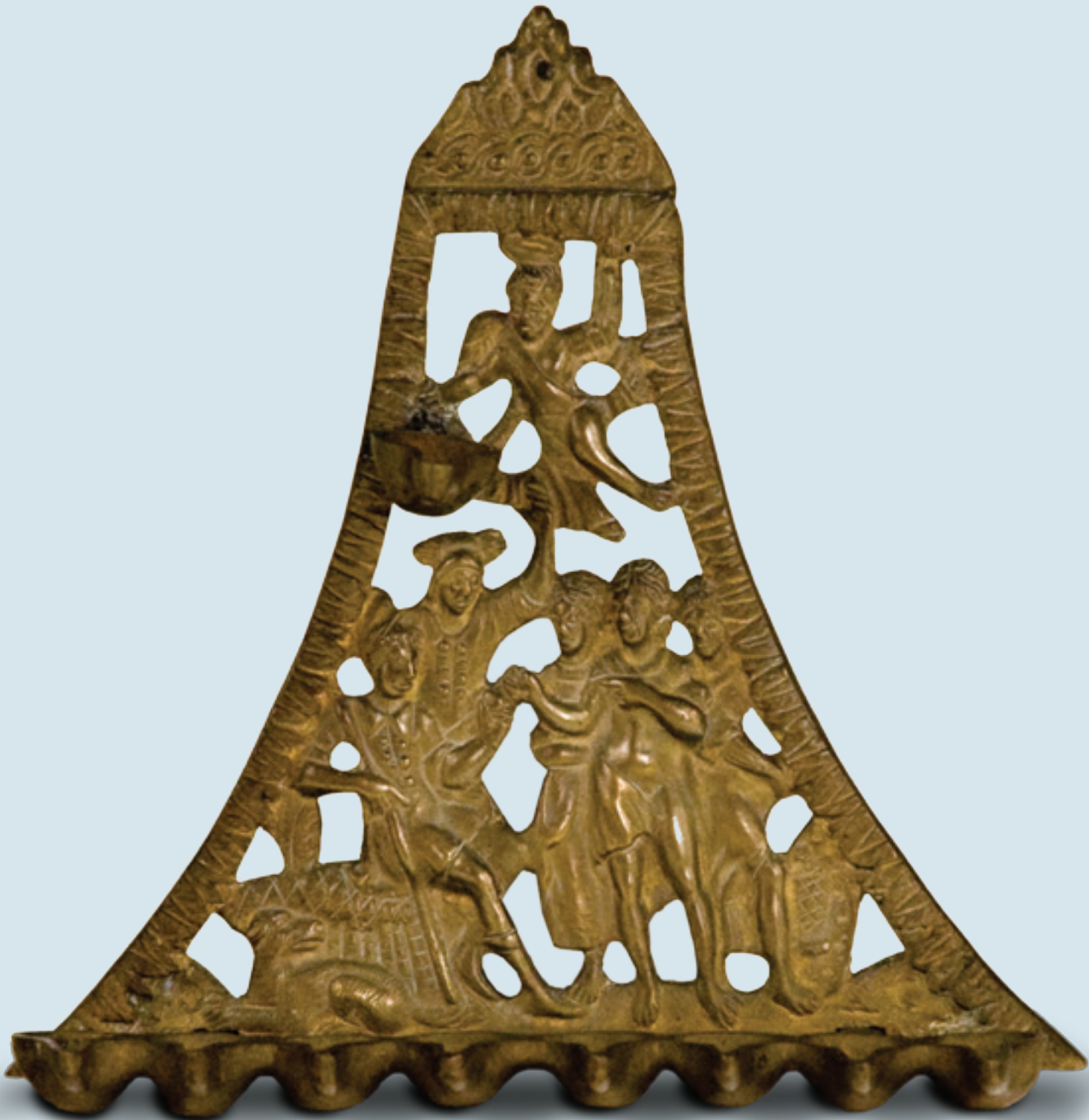
Hanukkah Lamp, 17th century, Italy; Brass. Loan from Judah L. Magnes Museum Purchase, Strauss Collection.

While Christian humanists in Renaissance Italy found kindred spirits in Classical authors, so did the Jews. The conquest of Byzantium by the Ottoman Turks in 1453 led to an exodus of Greek scholars and an influx into Italy of Greek texts. The characters of Greek myth were neither Christian nor Jewish, but rather, universal. The Hanukkah Lamp shown here on the left depicts the Judgment of Paris. In this story, the god Zeus refused to decide who among the goddesses Hera, Athena and Aphrodite, was the most beautiful, delegating this unwelcome task to a Trojan prince, Paris. Paris is seated in front of the three goddesses, while Zeus stands behind Paris. The god Hermes, who brought the message to Paris, hovers above. This is the event that precipitates the Trojan War, central to both Homer’s Iliad and Odyssey .