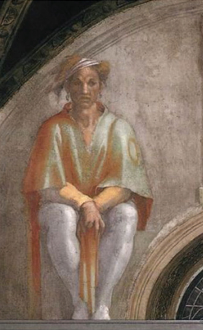
Lunette with Aminadab , Michelangelo Buonarroti (1475-1564); Location :Sistine Chapel, Vatican Palace, Vatican State. Aminadab, ancestor of David, and therefore of Jesus, was depicted by Michelangelo wearing the yellow “O” badge. This detail was difficult to see until after the restoration of the Sistine Chapel in 2001.

At the dawn of the 13th century, an invigorated Church forged the chains that would hold the newly economically important Jews in a subservient position within Christian society. The Fourth Lateran Council of 1215 required Jews to wear distinctive clothing. Jews would now be marked so that contact with them could be regulated and limited. Specifically, the way in which Jews were distinguished served to mark them as socially and theologically inferior. The badge in the shape of a circle indicated their separation from the cross. The yellow color of this badge (and later, hat) grouped the Jews in the same sinful social class as prostitutes, another necessary group that was seen to be tainted by corporeal lust and money.