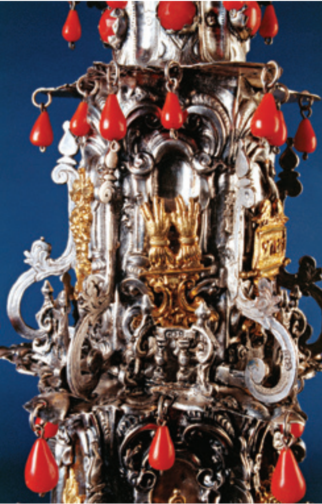
Rimmon (Ornament of the Torah Scroll), Florence. The red decorative pieces are coral. Jews in Livorno maintained a monopoly on the production of coral for decorative use in Italy.